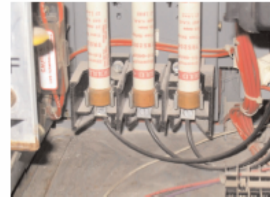
What You See