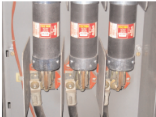
What You See