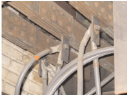
What You See

Infrared Electrical Systems Surveys Locate Your Problems Before They Happen Prevent Unscheduled Downtime, Equipment, Damage, and Electrical Fires